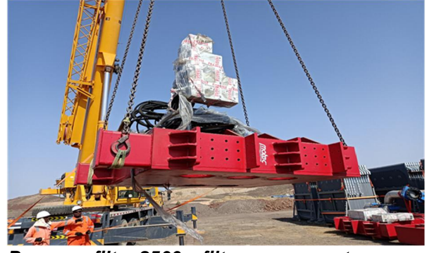
Pressure filter 2500 – filter component