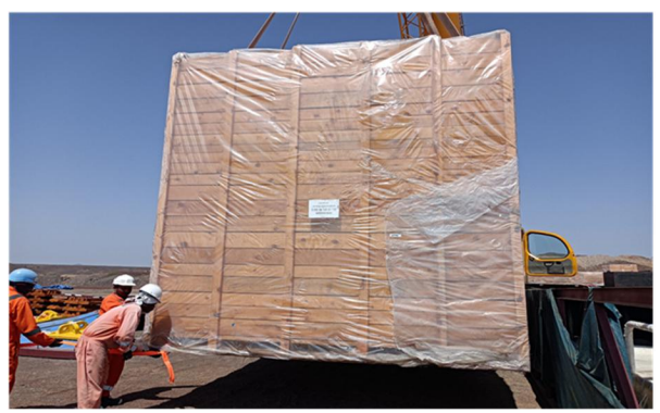
Regrinding mill body assembly (Metso)