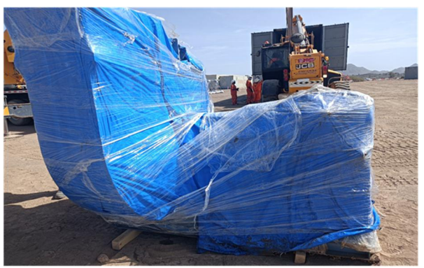
Dust collector centrifugal fan (Stratgem)