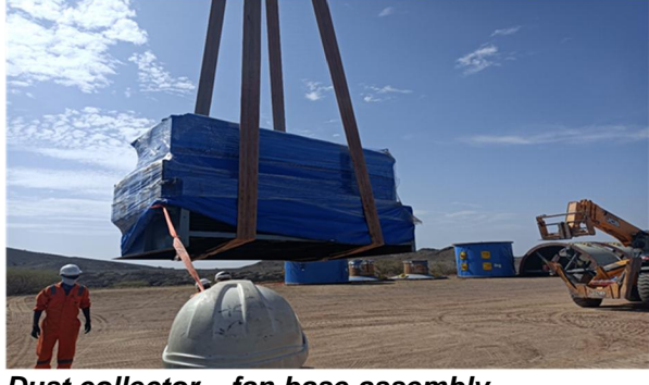
Dust collector - fan base assembly