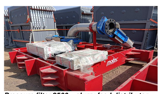
Pressure filter 2500 – slurry feed distributor