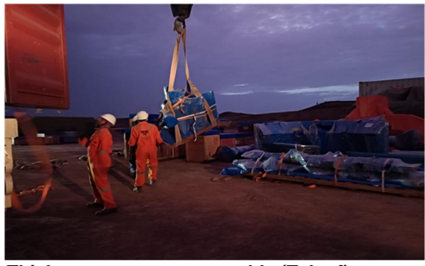
Thickener – canopy assembly (Takraf)