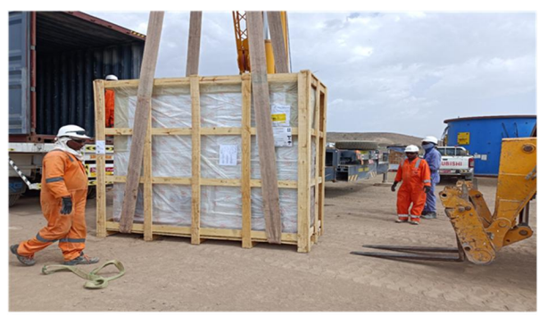
Regrinding mill control panel (Matec)