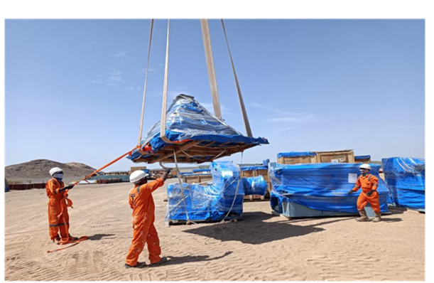
Dust collector - hoppers (Stratgem)