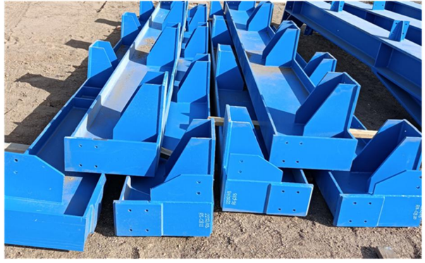
Plant structure material (Al Tasnim)