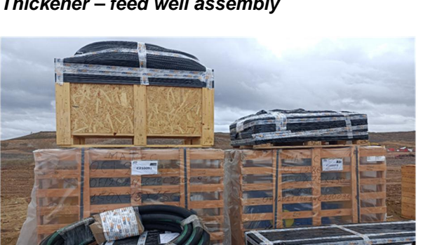
Pressure filter accessories (Matec)