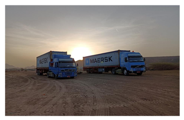
Takraf India consignment arrives onsite

The following photo set captures the arrival onsite of a range of mine site equipment consignments over recent weeks. This latest round of plant equipment deliveries included consignments from Takraf, Matec, Stratgem and Metso.