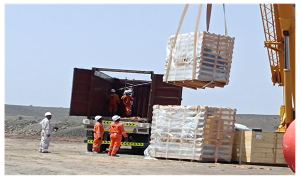
Accessories for pressure filter 2500 (Matec)