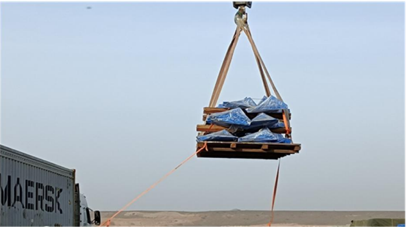
Thickener – rake mechanism assembly (Takraf)