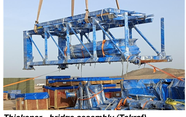
Thickener - bridge assembly (Takraf)