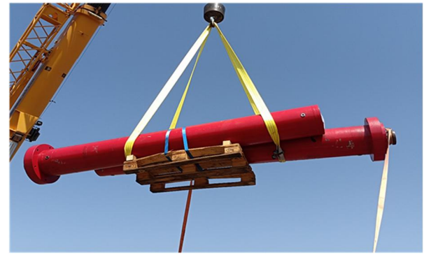
Hydraulic units (Matec)