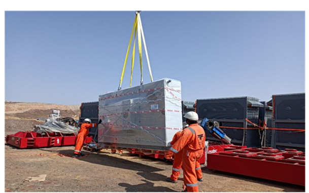
Pressure filter control panel (Matec)