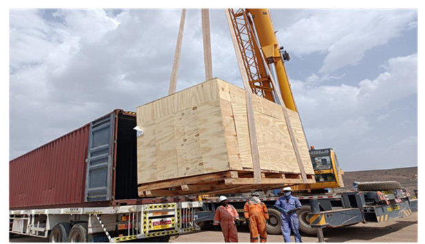
Regrinding mill motor (Metso)