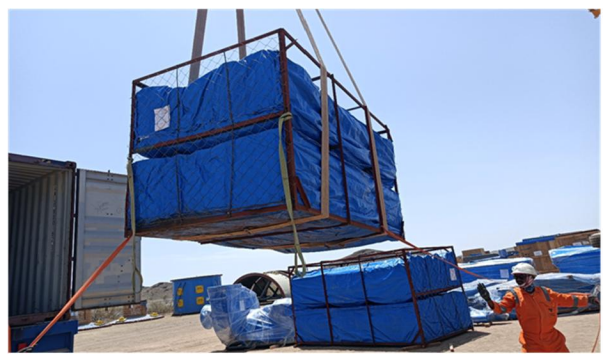
Dust collector cages (Stratgem)