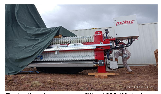
Protecting the pressure filter 1000 (Matec)