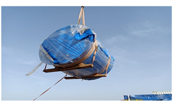
Thickener – flocculent preparation tank assembly (Takraf)