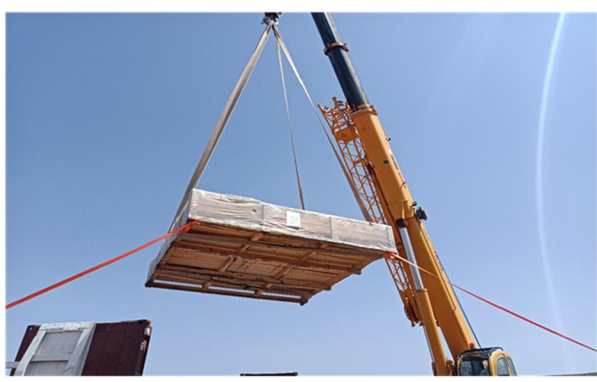
Regrinding mill base plate standard (Metso)