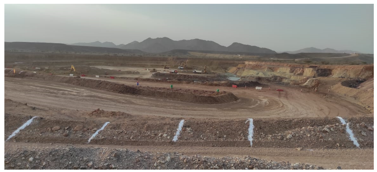
Al Wash-hi Majaza mine working - 7 August 2022 #2.

Below is an additional image showing mine working as at 7 August 2022.