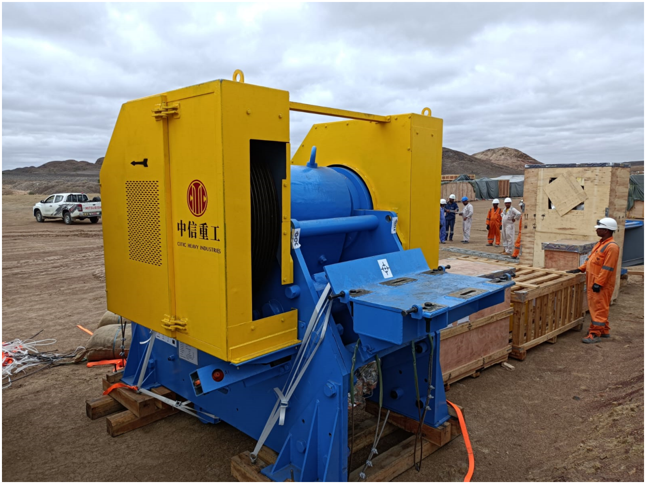
Crusher arrives on site

A number of the 50 equipment packages critical to Project delivery have recently arrived on site. The photo below depicts the crusher being unpacked on site.