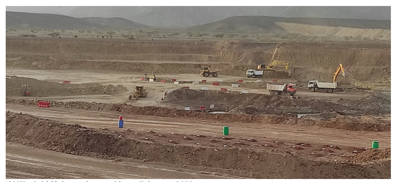
Al Wash-hi Majaza mine working - 7 August 2022.

Perth, Australia: Alara Resources Limited (ASX: AUQ) ( Alara or the Company ), a base and precious metals explorer and developer with projects in Oman, is pleased to provide an update on its project development activities at the Al Wash-hi Majaza Copper-Gold Project ( Project ) in that country. Alara owns a 51% equity interest in the Al Hadeetha Resources LLC ( AHRL ) joint venture which is developing the Project.