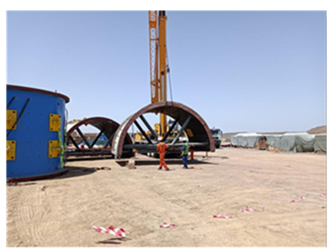
Half shells (SAG mill)