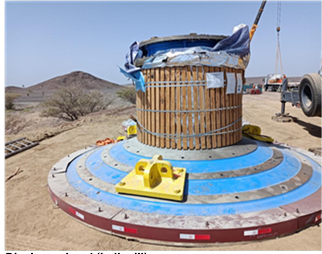
Discharge head (ball mill)