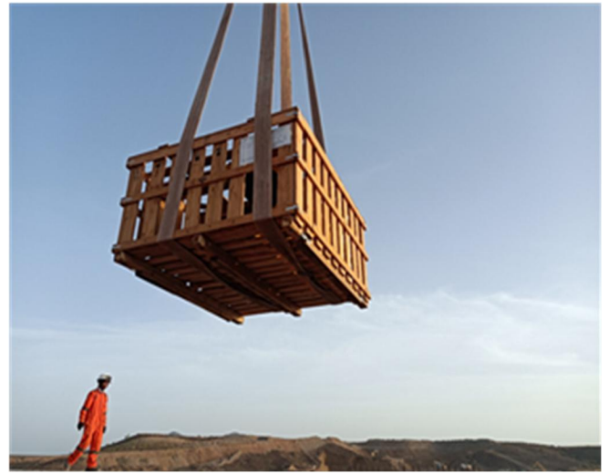
Unloading LSS coupling guard (SAG mill)