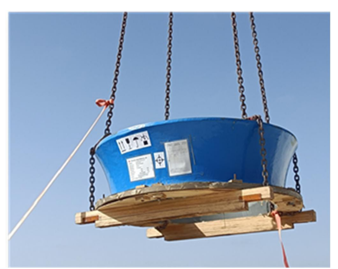
Bell mouth (SAG mill)