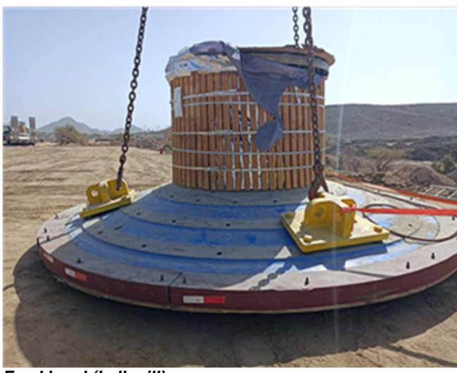
Feed head (ball mill)