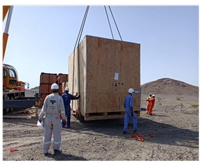
Unloading main motor (SAG mill)