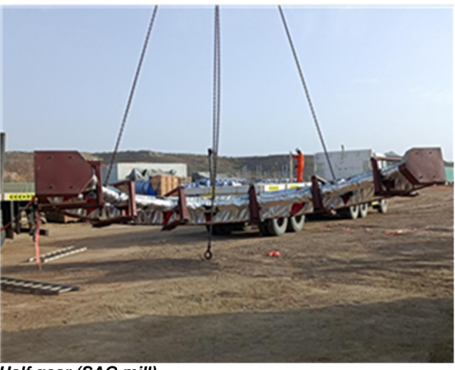
Half gear (SAG mill)