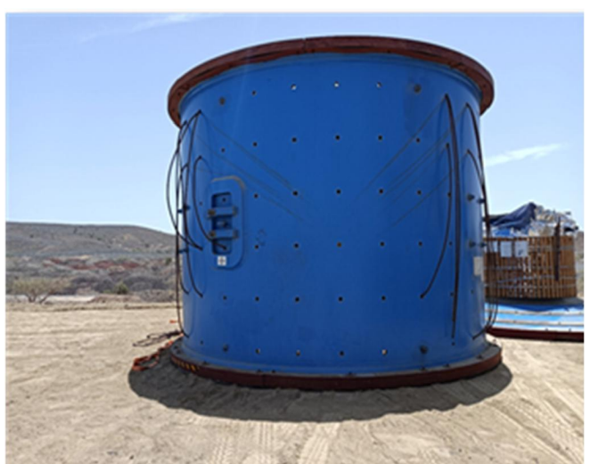
Feed shell (ball mill)