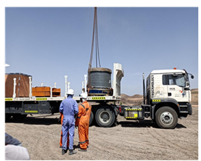
Pulp lifting (SAG mill)