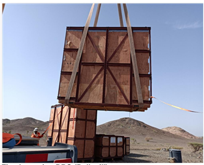
Fixed trunnion BRG (Ball mill)