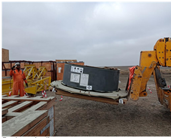
Feed trunnion liner