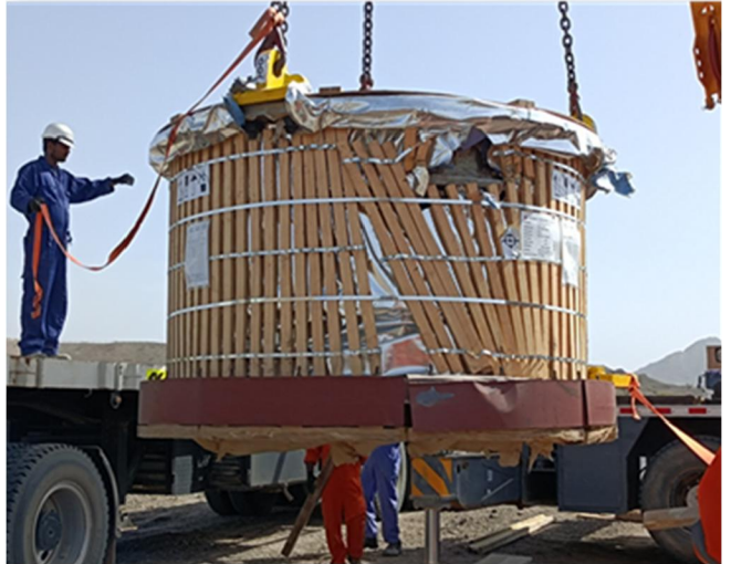
Feed end trunnion (SAG mill)