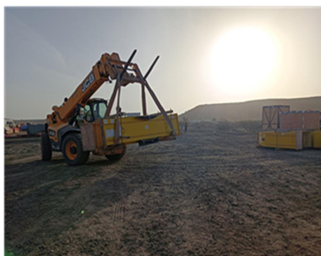
LSS coupling guard (SAG mill)