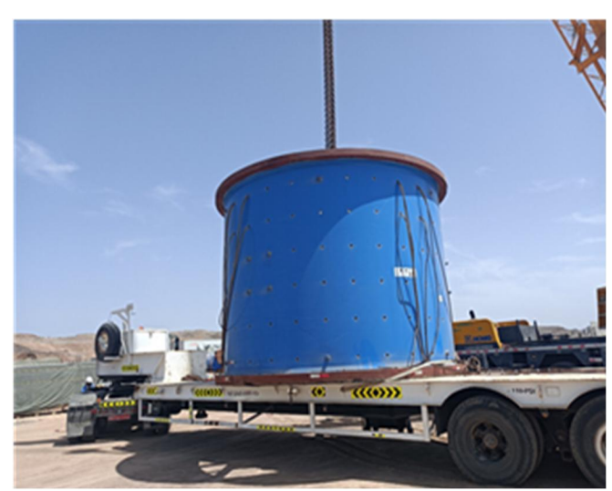
Discharge shell (ball mill)