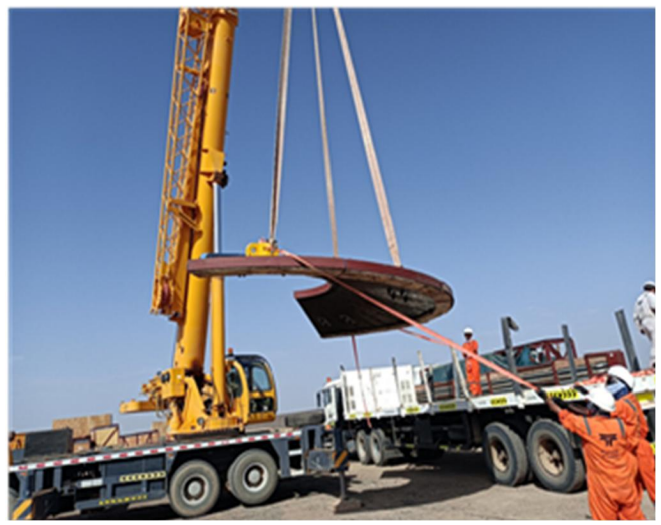
Feed half head (SAG mill)