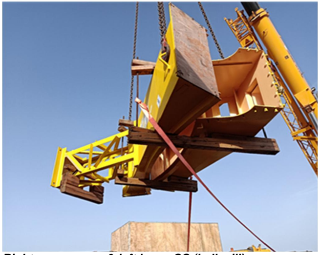
Right upper cover & left lower CC (ball mill)