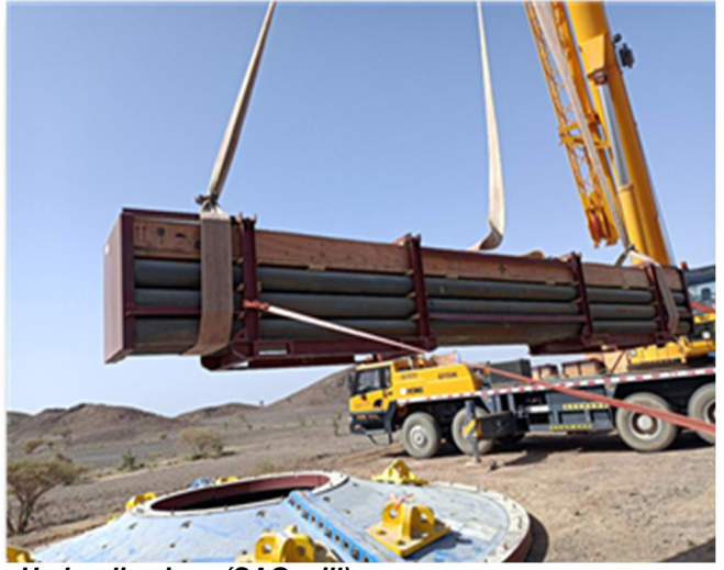
Hydraulic pipes (SAG mill)