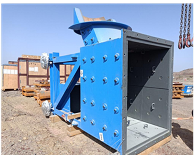
Feed trolley (SAG mill)