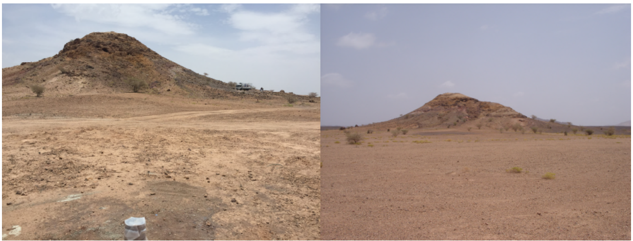
Picture: Washihi gossan hill located within the new mining licence area.

PERTH: Alara Resources Limited (ASX: AUQ) ( Alara or Company ) is pleased to announce a mining licence has been approved and signed for its Al Hadeetha Copper Project in Oman.