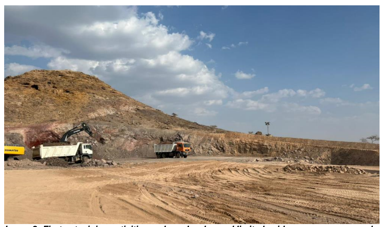
Image 2: First cut mining activities and overburden and limited oxide copper ore removal