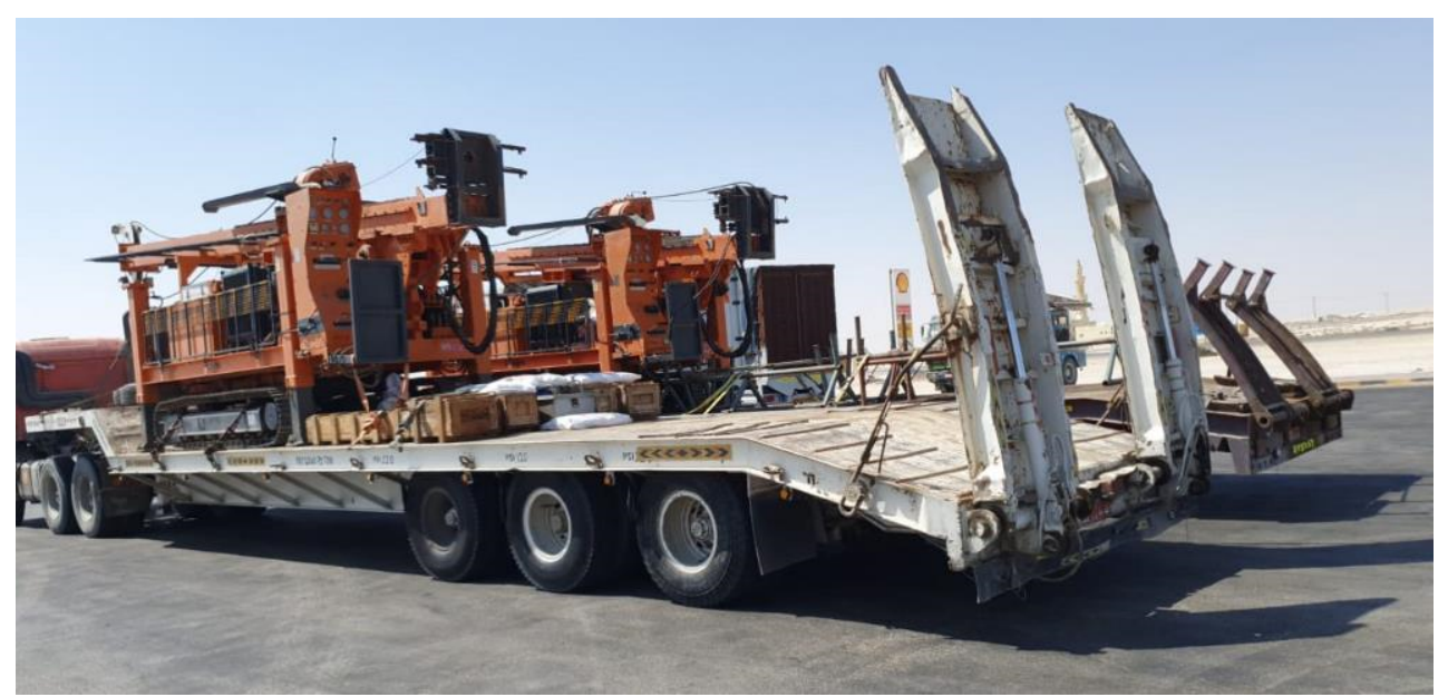
Image 8: Alara drill rigs make their way to the Al Rimal limestone project

Alara Resources LLC has been awarded an exploration drilling contract at the Al Rimal limestone project in southern Oman. Two drill rigs and crew have been mobilized to the site to complete 3500m of drilling in the first phase.