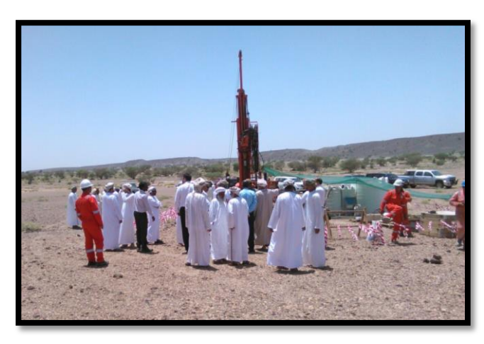
Government representatives and community leaders come to view drilling operations at the Washihi site.

Web | www.alararesources.com Email | info@alararesources.com