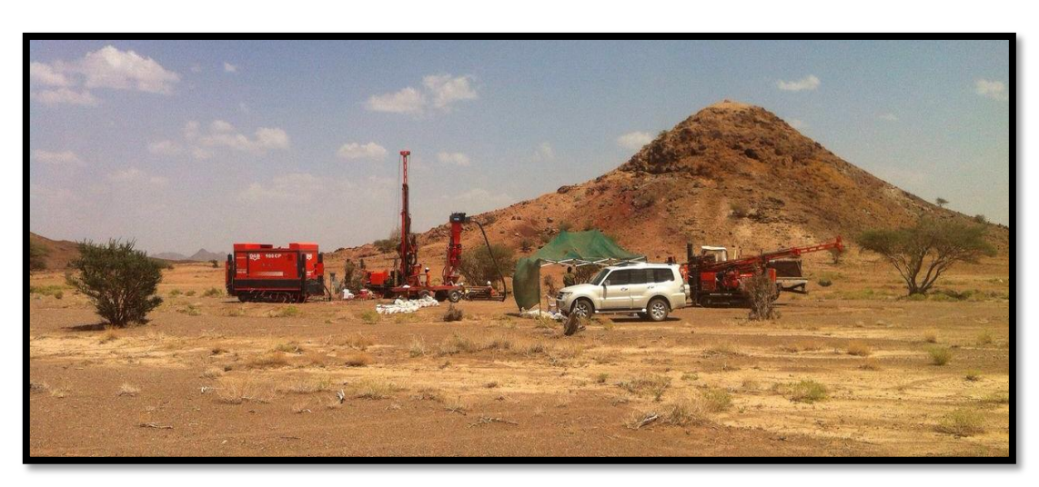
Drill rig set up at Washihi near gossan hill

Web | www.alararesources.com Email | info@alararesources.com