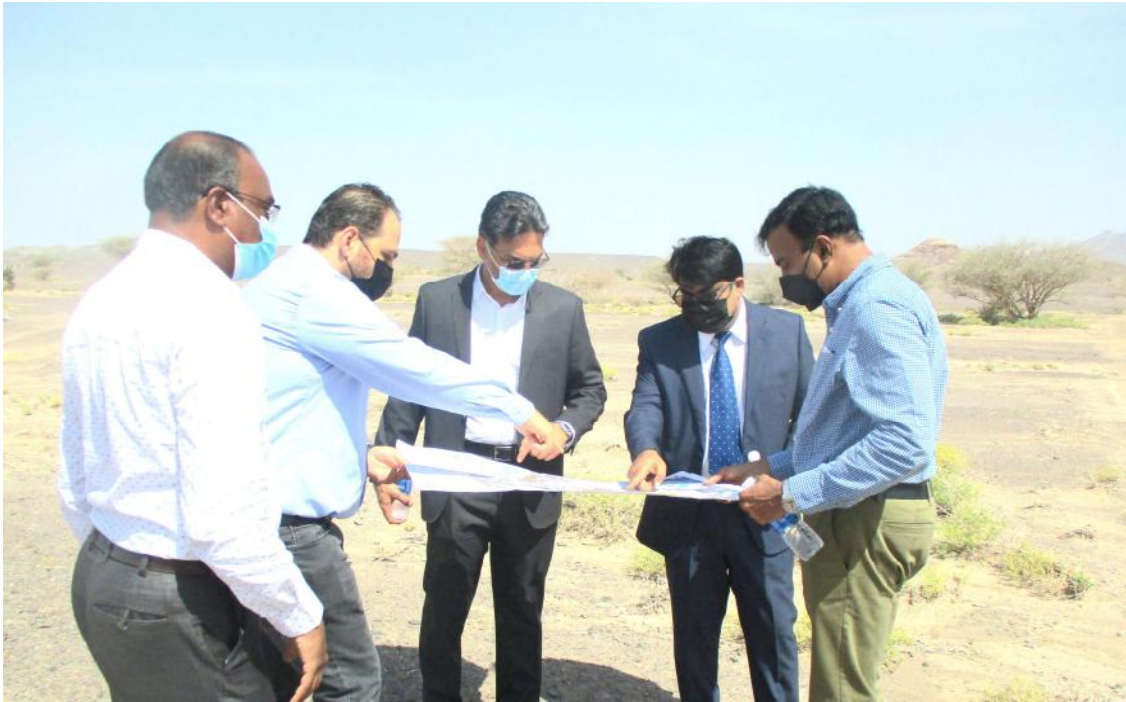
Picture 2: Accommodation village layout review with JV partners and construction engineers.