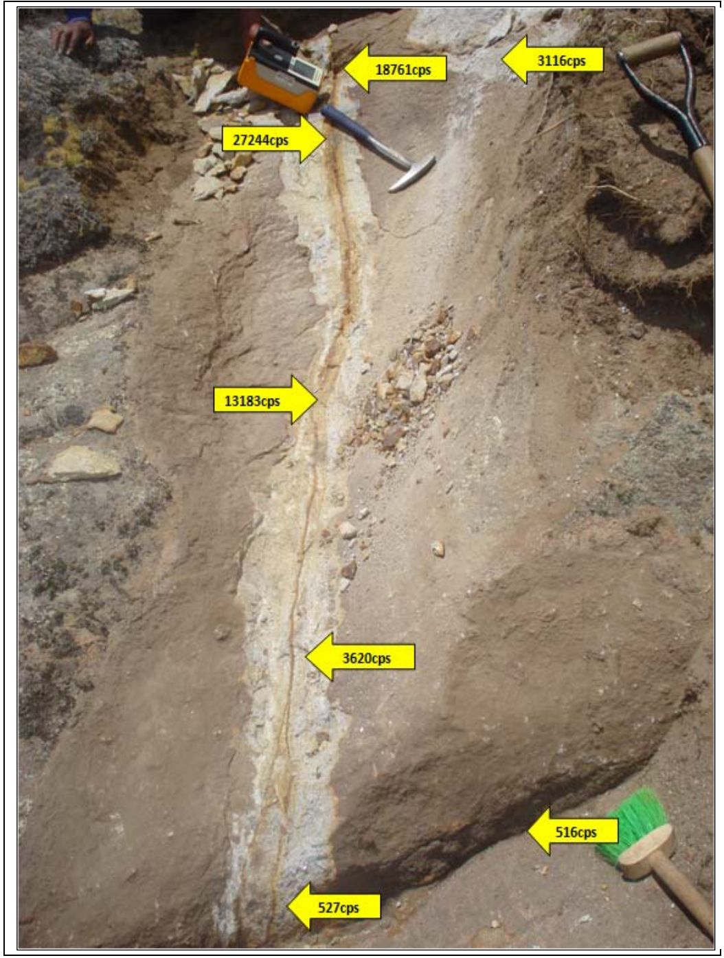
Figure 2. Crucero Project - Autinite-filled fracture in Ignimbrite host rock, as shown by anomalous spectrometer readings (measured in total counts per second (cps)).

Following the discovery of uranium in the Lituania 3 concession the Company successfully negotiated an agreement in December 2007 with Sheridan Resources SAC, for the acquisition of the mineral rights (100% of uranium rights and vanadium, phosphates, and other radioactive mineral rights associated with uranium production) within the adjoining Rosita Dos concession.