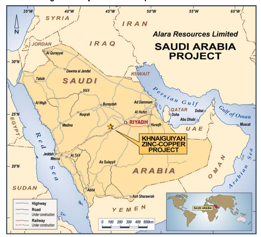
Figure 1: Project Location Map Within Saudi Arabia

The Project is located on a bitumen road ~170km west of Riyadh, the capital of Saudi Arabia near the major Riyadh to Jeddah highway.