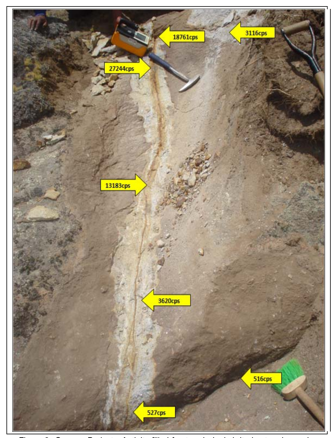
Figure 2. Crucero Project - Autinite-filled fracture in Ignimbrite host rock, as shown by anomalous spectrometer readings (measured in total counts per second (cps)).

Following the discovery of uranium in the Lituania 3 concession the Company successfully negotiated an agreement in December 2007 with Sheridan Resources SAC, for the acquisition of the mineral rights (100% of uranium rights and vanadium, phosphates, and other radioactive mineral rights associated with uranium production) within the adjoining Rosita Dos concession.